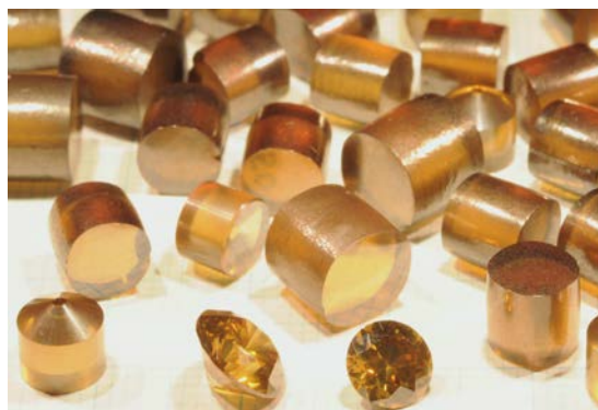
Fig.1. BOTCHAN-6000 (left) and some examples of the NPD samples with various shapes.